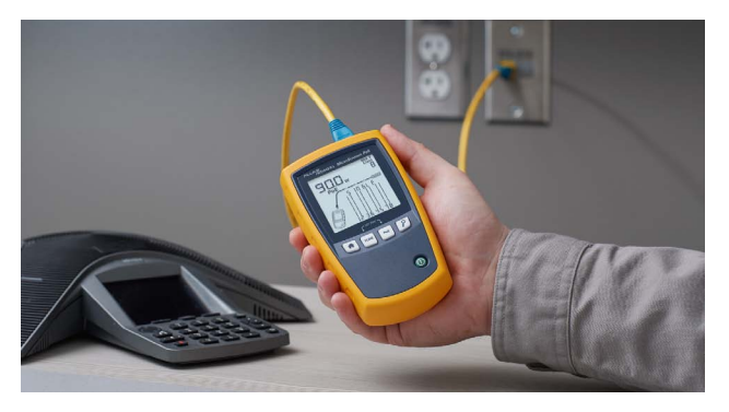
Figure 5. The MicroScanner PoE can detect the power offered by the PSE plus the network's speed, and features a suite of cable testing features.

Fluke Networks P.O. Box 777, Everett, WA USA 98206-0777